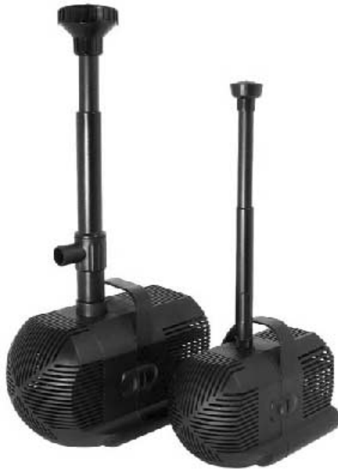
Pump Performance Chart

Energy Efficient, Submersible Pumps for Decorative Fountains, Waterfalls and Filters