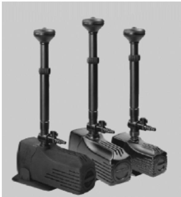
Fountain Accessories Sold Separately

Submersible Pumps for Decorative Fountains, Waterfalls and Aquariums