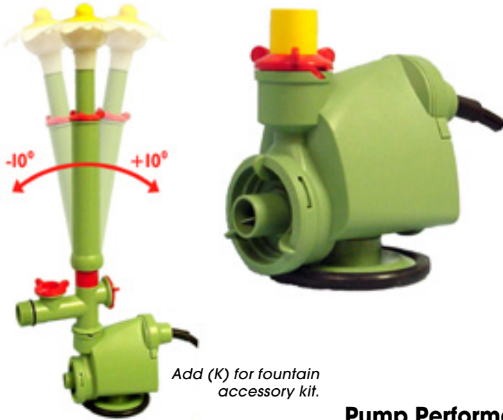
Add (K) for fountain accessory kit.